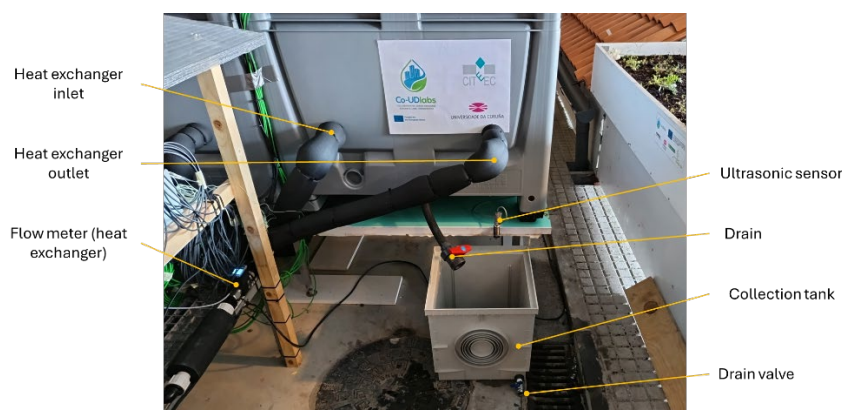
Figure 2. View of one of the testing boxes.

the effluent, as well as for measuring the outflow from the boxes using an ultrasonic sensor (see Figure 2).